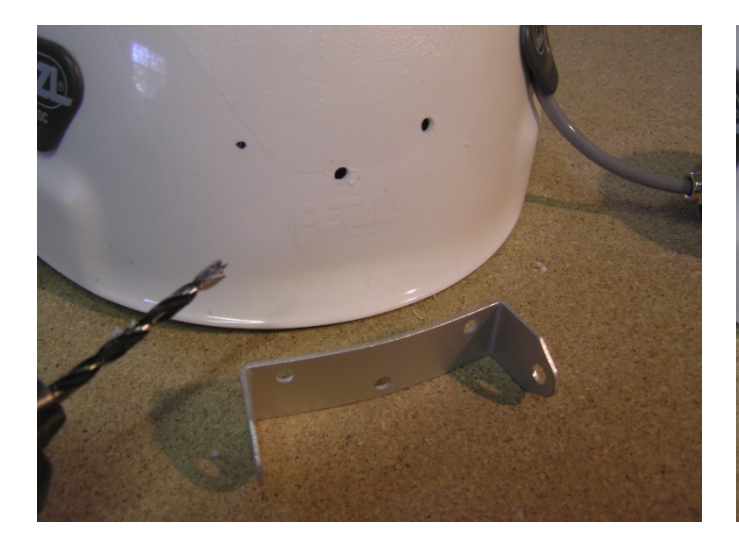
Prepared drillings for the lamp holder

We recommend leading the lamp cable on the inner side of the helmet. In that way the connector is well protected.